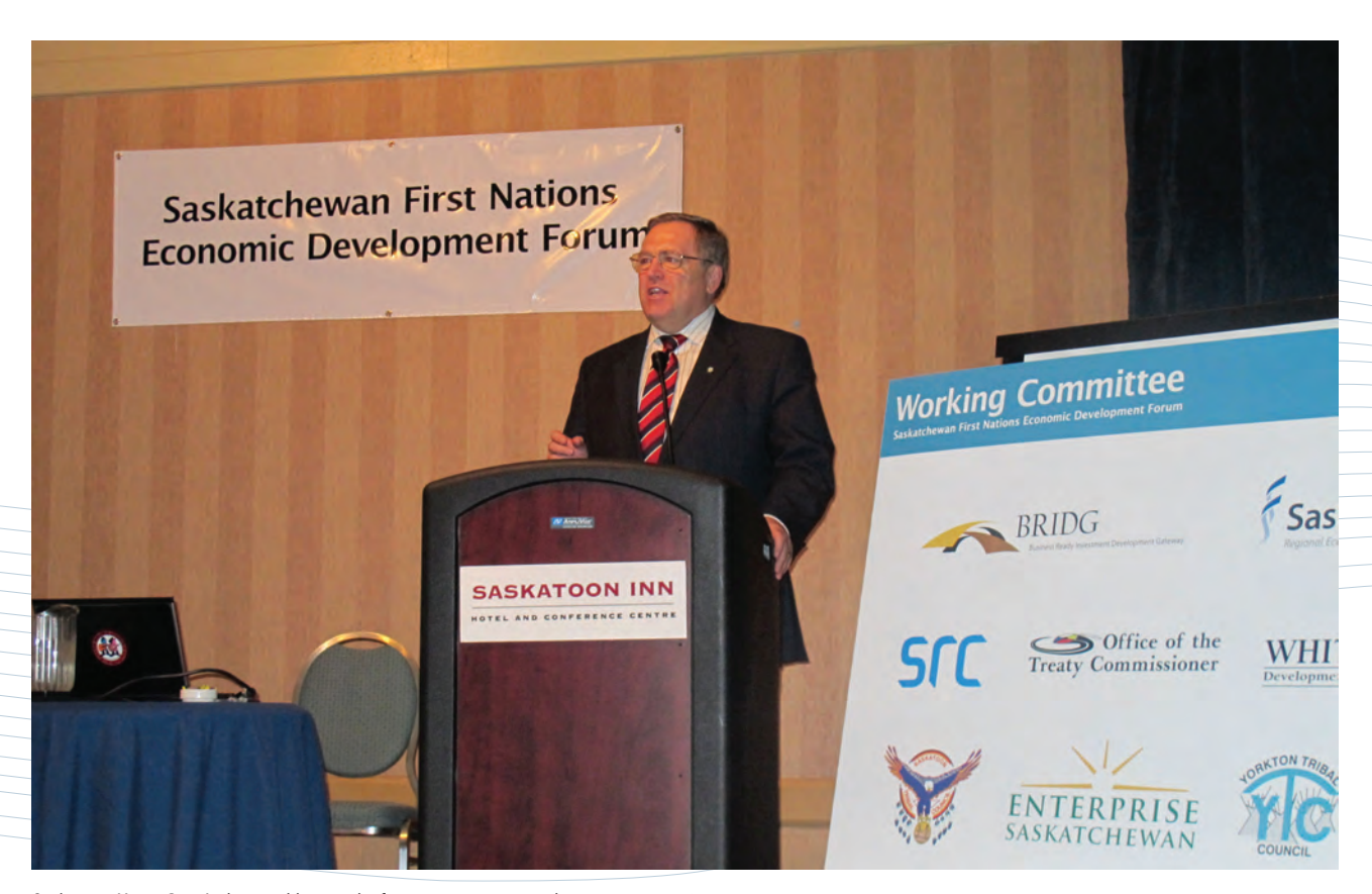
Saskatoon Mayor Don Atchison addresses the forum participants at the opening reception.

Those involved in First Nations economic development understand that there is no silver bullet or magic solution that will address all of the challenges faced by First Nations communities. But a network of those involved most intimately in aboriginal community, economic, and business development cannot but help facilitate partnerships, disseminate best practices, pool resources, develop leadership, and generally help fulfill the shared objective of building healthy and prosperous aboriginal communities in Saskatchewan.