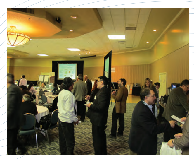
Saskatchewan First Nations Economic Development Forum participants network during the coffee break.

The overall contribution of First Nations to the province of Saskatchewan's economy is estimated at $1.85 billion already, and is steadily increasing. The enhanced prosperity of First Nations communities will be a huge factor in the economic and social well-being of the province in the decades to come.